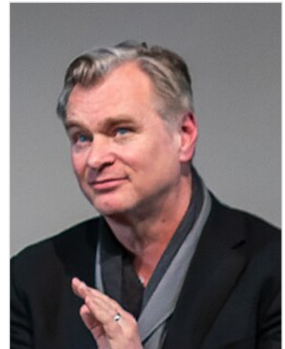
Writer and director Christopher Nolan reunited with Universal Pictures to develop The Odyssey as his follow-up to Oppenheimer

By November 2023, director Christopher Nolan had yet to decide what his next film would be after Oppenheimer (2023). While he was receptive to various ideas for his follow-up, the director felt he would have to "own it completely". [29] After winning the Academy Awards for Best Picture and Best Director for Oppenheimer in March 2024, Nolan began writing the script for his next film. [30][31] In May 2024, Nolan's wife and producing partner, Emma Thomas , said that following Oppenheimer 's success, the duo felt they had an opportunity to explore unlimited possibilities but had yet to deliberate practicalities. [29] Nolan was revealed in October to be developing his next film at Universal Pictures , after working with that studio on Oppenheimer . Nolan was confirmed to be writing the script and producing the film once again with Thomas through their production company, Syncopy . Matt Damon was in talks to star in the film, after collaborating with Nolan on Oppenheimer and Interstellar (2014), and filming was slated to begin in early 2025. Unlike Oppenheimer , which Universal acquired at auction, this film was set up directly at the studio and given a release date of July 17, 2026. [32][33]