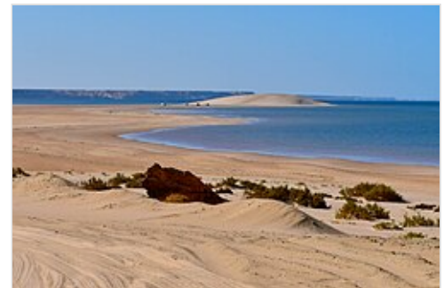
Some scenes were filmed at the White Dune near the Moroccan-occupied city of Dakhla , Western Sahara , which garnered some criticism.

Filming took place between July 17 and 22, with Damon and Zendaya, at the White Dune near Dakhla , Western Sahara , [73][59][74][75] a city under Moroccan occupation since 1975. [76][75][61] The UN-recognized Polisario Front and organizers of the Sahara International Film Festival decried the decision to film in Western Sahara as whitewashing Morocco's colonialism. [60][74] The festival's organizers called for the production to be halted, but filming in the territory had already concluded. [75][74] They subsequently released a statement calling on Nolan to obtain consent from "the legal representatives of the Sahrawi people" or otherwise remove the scenes shot in Dakhla. This statement was signed by several prominent figures, including Spanish actors Carlos and Javier Bardem , Luis Tosar , Carolina Yuste , and Juan Diego Botto , Spanish filmmakers Rodrigo Sorogoyen and Icía Bollaín , and Sahrawi human rights defender Elghalia Djimi . [77][78][79] Meanwhile, the Moroccan Cinematographic Center called The Odyssey an important production to Morocco's promotion of its film industry and said that it was the first major American film to be filmed in that territory. [60][61]