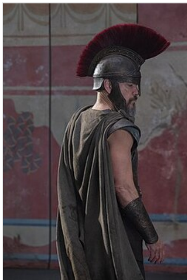
A promotional image of star Matt Damon in costume as Odysseus was noted for the historical inaccuracies in its design. [84]